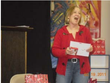
Valentine Party Gift Exchange