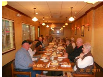
Dinner Ride at Olive Garden, Knoxville